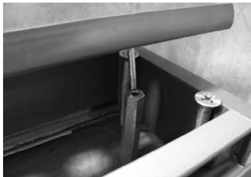
Installation of Tile Top Strainer Grate pins into stand-offs.

Screw these two (2) stand-offs into the drain, one at each end of the drain base. The pins on the Tile Top Strainer will slip into the holes on the top of these stand-offs.