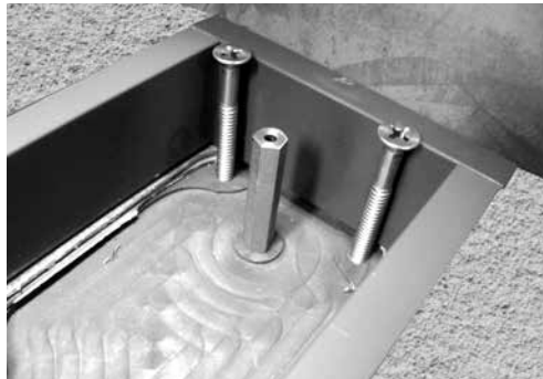
Installation of stand-off pins into end of Linear Drain base.

bronte Linear Drain - Tile Top Strainer Grate Instruction Guide: STEP 3.2